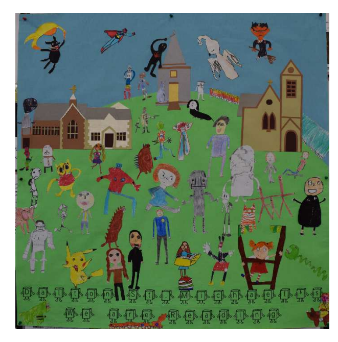
Roby Mill (below)